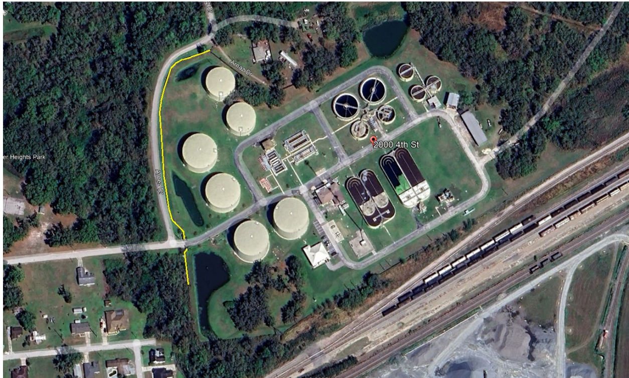
Google Earth Image of Utilities Plant with yellow Outline of Proposed New Pre-cast Concrete Wall Location (Not to Scale)