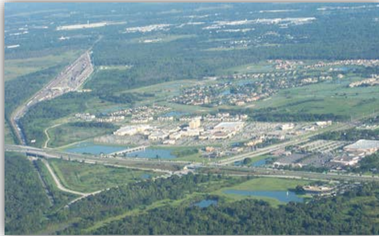
Figure 3 Harden/Parkway CRA Aerial View