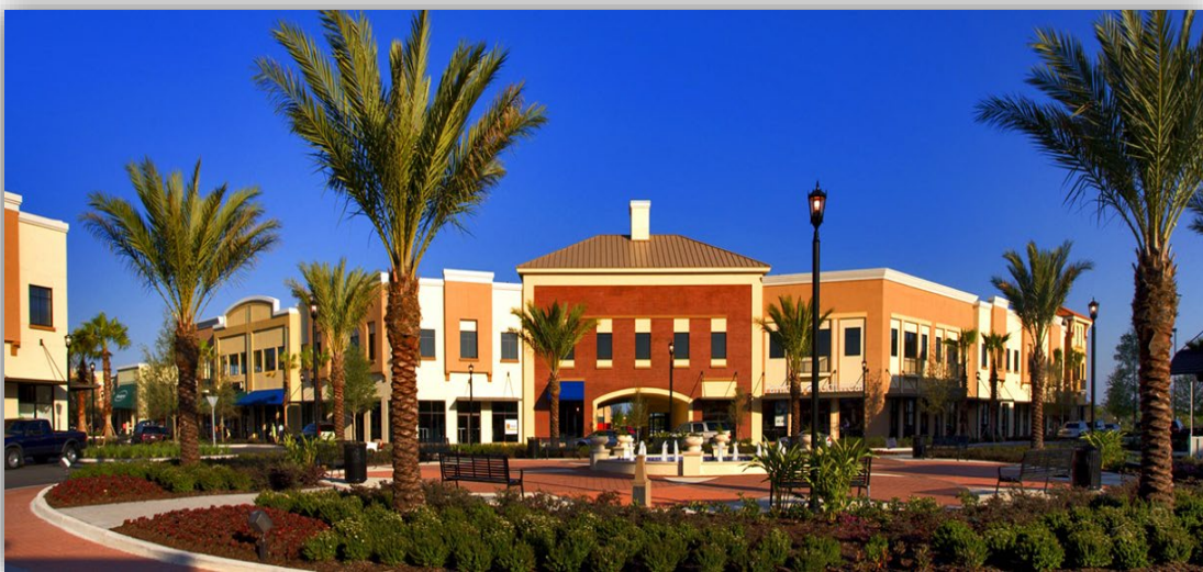
Figure 4 Harden/Parkway CRA, Lakeside Village

The Harden/Parkway CRA is in current debt repayment due to the County and City establishing an Interlocal Agreement to cooperate in creating this CRA, for the purpose of eliminating transportation system blight in the area as mentioned in Section II. The County borrowed the funds to complete transportation and roadway improvements prior to 2013.